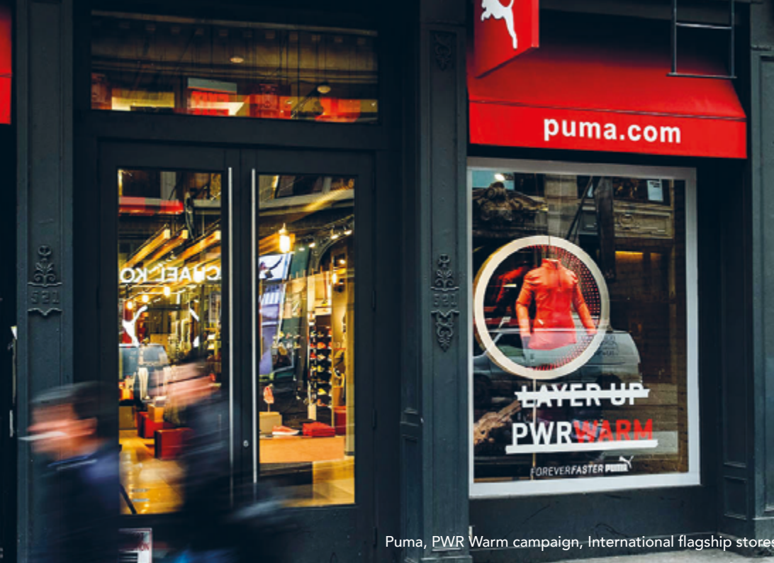
Puma, PWR Warm campaign, International flagship stores