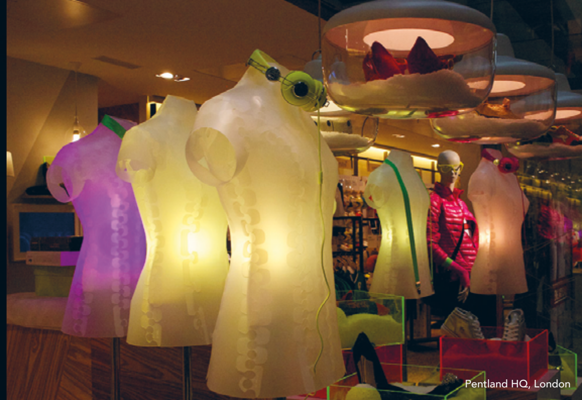
Pentland HQ, London