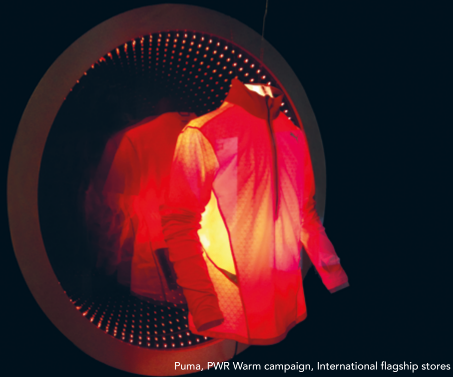
Puma, PWR Warm campaign, International flagship stores