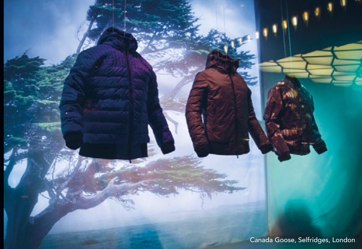
Canada Goose, Selfridges, London