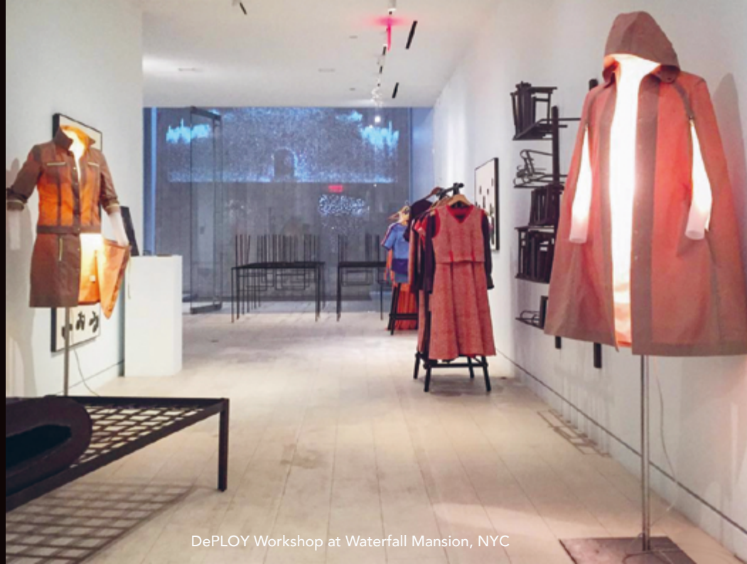
DePLOY Workshop at Waterfall Mansion, NYC