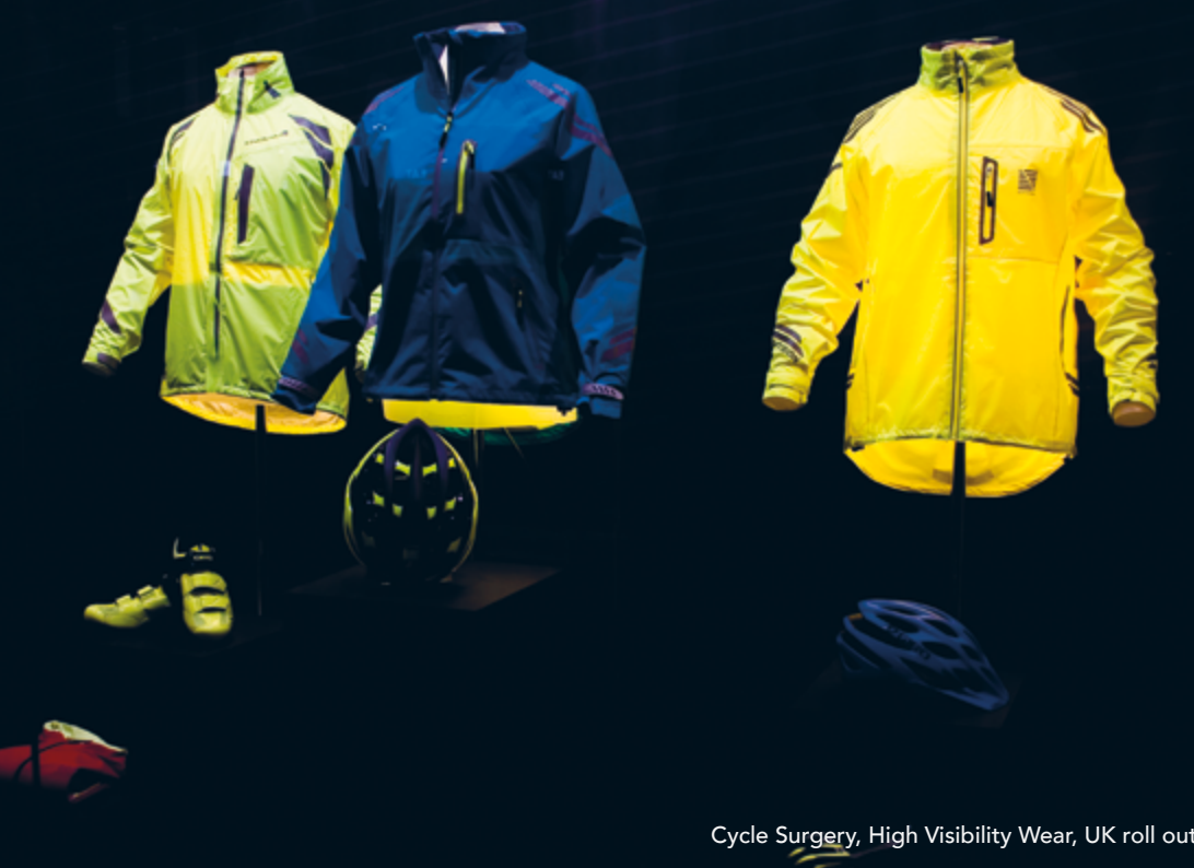
Cycle Surgery, High Visibility Wear, UK roll out