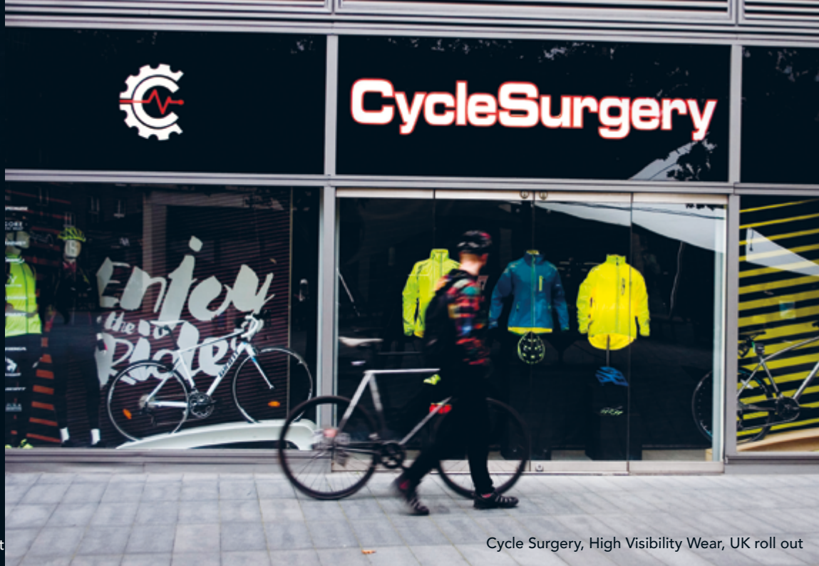
Cycle Surgery, High Visibility Wear, UK roll out