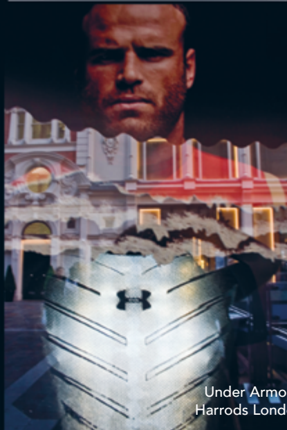
Under Armour, Harrods London