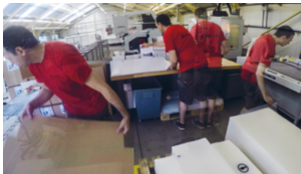
Mannequinos being made in Cambridgeshire, one made every 6 minutes in a non-toxic environment.