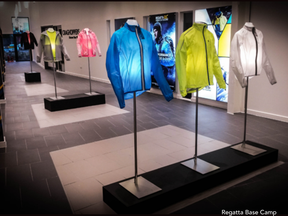
Regatta Base Camp