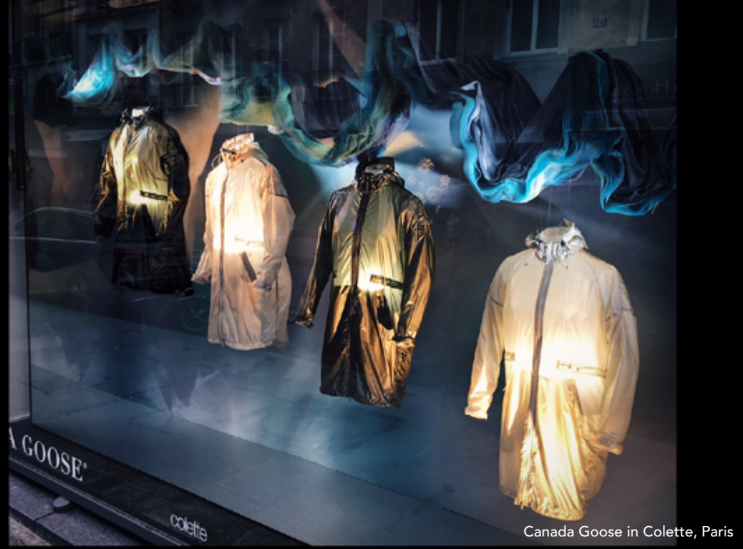
Canada Goose in Colette, Paris