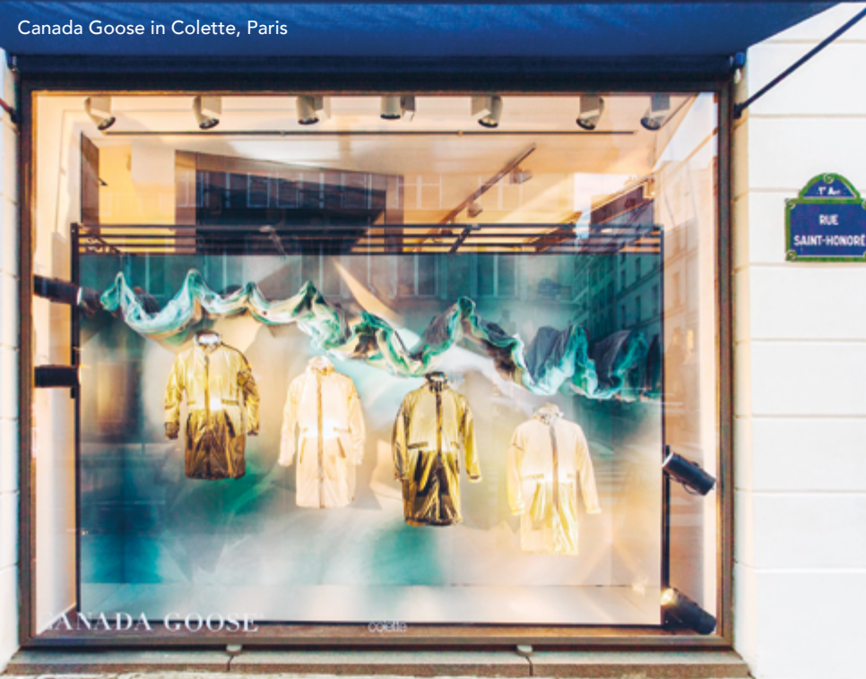
Canada Goose in Colette, Paris