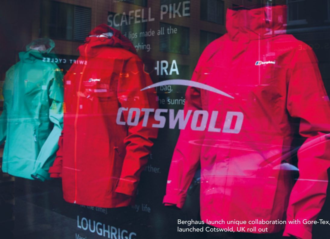
Berghaus launch unique collaboration with Gore-Tex, launched Cotswold, UK roll out