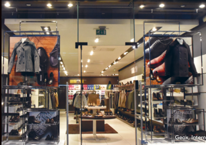
Geox, International roll out